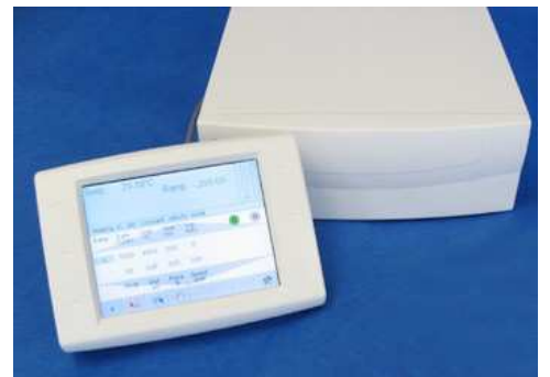
PE95-LinkPad Temperature Controller