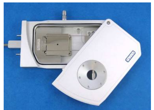
LTS120 stage showing microscope slide holder