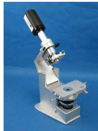
Linkam Imaging Station. Optics are tilted back to allow easy access to sample