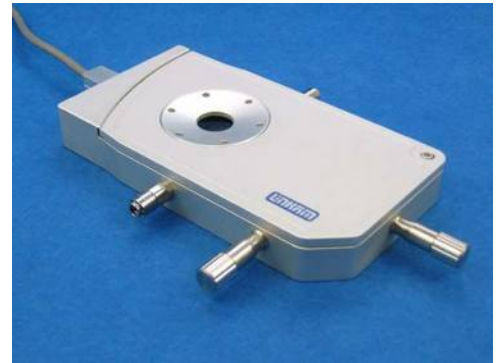
The LTS120 heating and freezing stage