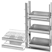
Wire shelves (left), Sliding racks (right)