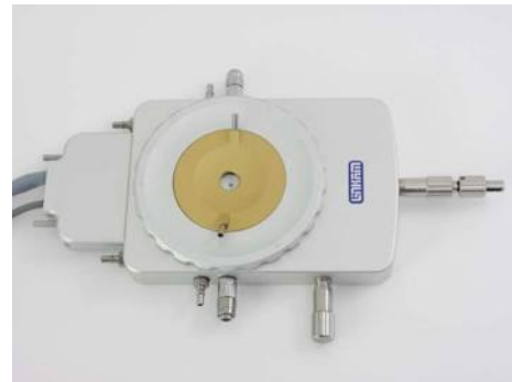
The TS1400 XY heating stage

The QICAM fast 1394 shown here is designed for high resolution brightfield scientific and industrial applications. The 1.4 megapixel CCD sensor is capable of 10fps at full resolution and 165 fps when using