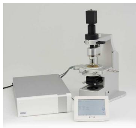
High Temperature System with T95-LinkPad controller