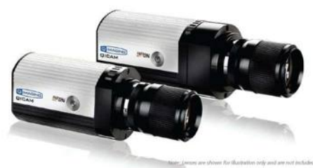
QICAM fast 1394 camera cooled and non-cooled options (shown with Nikon lenses for