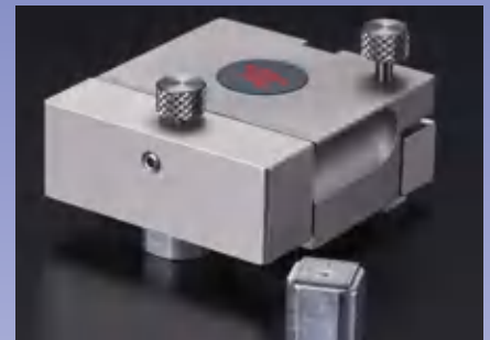
TriPod for parallel polishing