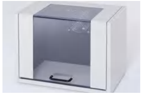
Noise protection box