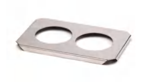
Perforated cover for using beakers