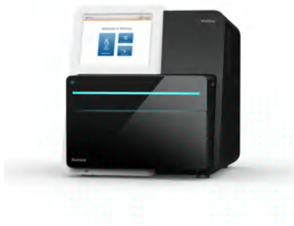
Figure 1: The MiniSeq System —By harnessing advances in SBS chemistry and simple, streamlined workflows, the MiniSeq System delivers a library-to-results solution that is powerful and easy to use.

Illumina scientists and engineers provide installation, training, and support, from assay design through data analysis