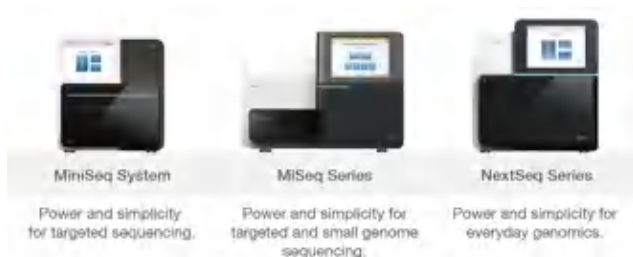
Figure 3: Illumina NGS portfolio of benchtop sequencers —Illumina NGS systems offer solutions for virtually every application, sample type, and sequencing scale. Each delivers high data quality and accuracy with flexible throughput and simple, streamlined workflows. Data can be easily compared, exchanged, and analyzed in BaseSpace Sequence Hub.