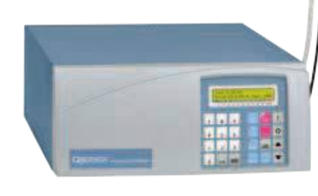
Stand sold separately.