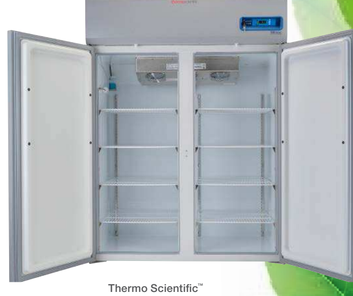
Thermo Scientific TSX 1447 liter refrigerator