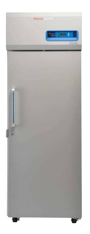
Thermo Scientific™ TSX 659 liter freezer