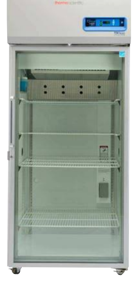
Thermo Scientific™ TSX 827 liter chromatography refrigerator