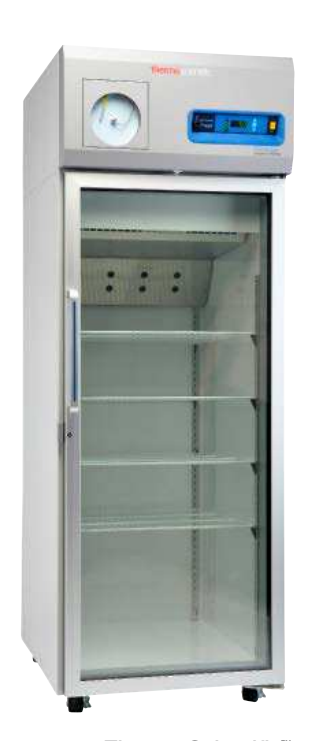
Thermo Scientific™ TSX 650 liter refrigerator