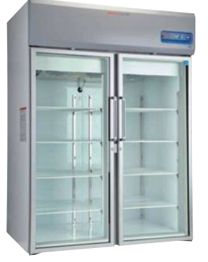
Thermo Scientific™ TSX 1447 liter Refrigerator