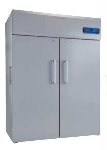
Thermo Scientific™ TSX 1447 liter freezer