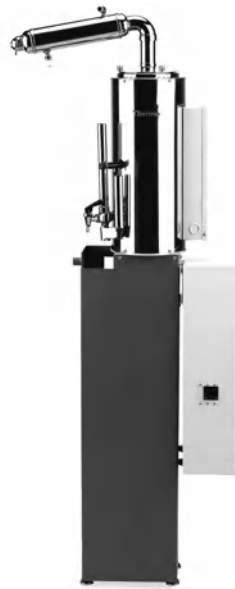
Thermo Scientific Barnstead Classic Still

If you do not have access to distilled water, one option for using Type 1, DI or ultrapure water in the incubator is to add a little sodium bicarbonate to the water to raise the pH and to add some ions. But it must be a sterile solution of the salt, and you must ensure the final pH of the water is in the 7-9 range.