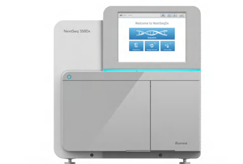
Figure 1: The NextSeq 550Dx Instrument —By leveraging the latest advances in SBS chemistry and user-friendly, regulated workflows, the NextSeq 550Dx instrument delivers high-quality results for both clinical and research applications.

At the core of the NextSeq 550Dx instrument is proven Illumina sequencing by synthesis (SBS) chemistry—the most widely adopted NGS chemistry in the world. 1 This reversible, terminator-based method detects single bases as they are incorporated into growing DNA strands and enables the parallel sequencing of millions of DNA fragments. Illumina SBS chemistry employs natural competition among all four labeled nucleotides, which reduces incorporation bias and allows more robust sequencing of repetitive regions and homopolymers. 2