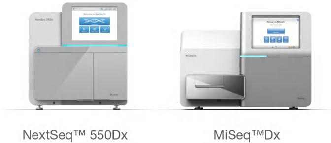
Figure 3: Illumina NGS sequencing systems portfolio —Illumina NGS systems offer solutions for a broad range of applications, sample types, and sequencing scales. Each delivers high-quality data and high accuracy with flexible throughput and simple, streamlined workflows.

The NextSeq 550Dx instrument offers fully integrated onboard analysis software with modular software architecture to support current and future assays. Instrument control software is accessed through a user-friendly touch screen interface. Local Run Manager software supports planning sequencing runs, tracking libraries and runs with audit trails, and integration with onboard data analysis modules. While Local Run Manager runs on the instrument computer, users can monitor run progress and view analysis results from other computers connected to the same network. After a sequencing run is completed, Local Run Manager automatically starts data analysis using one of the application-specific analysis modules.