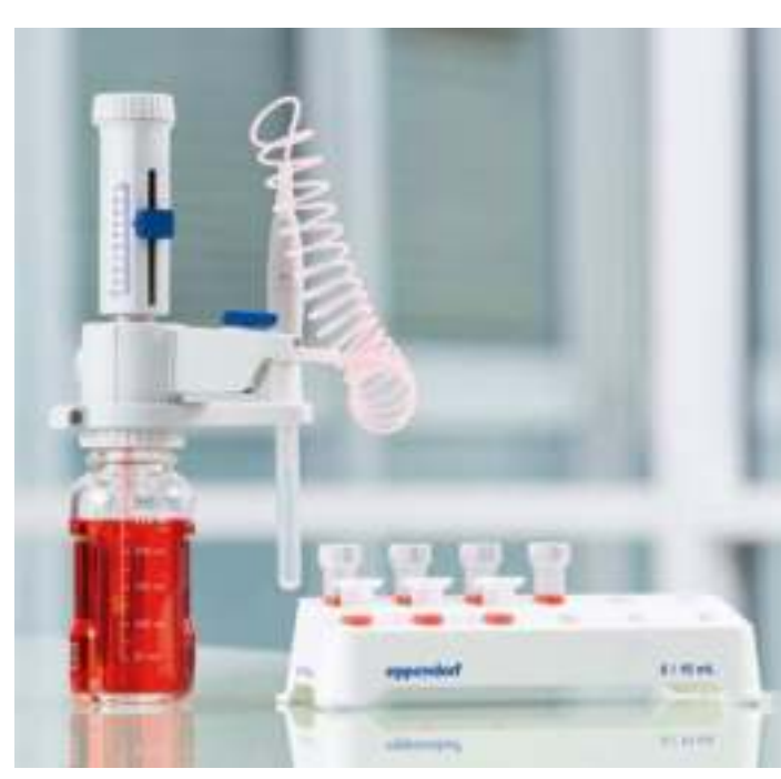
The flexible discharge tube gives you safe and direct access to your small and narrow test tubes and allows for fast and precise serial dispensing.