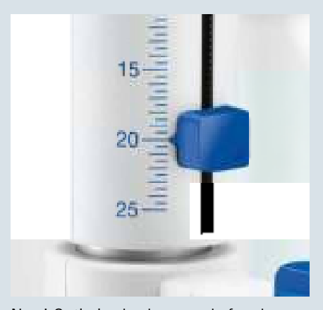
New! Optimized volume scale for clear visibility and precise volume adjustment