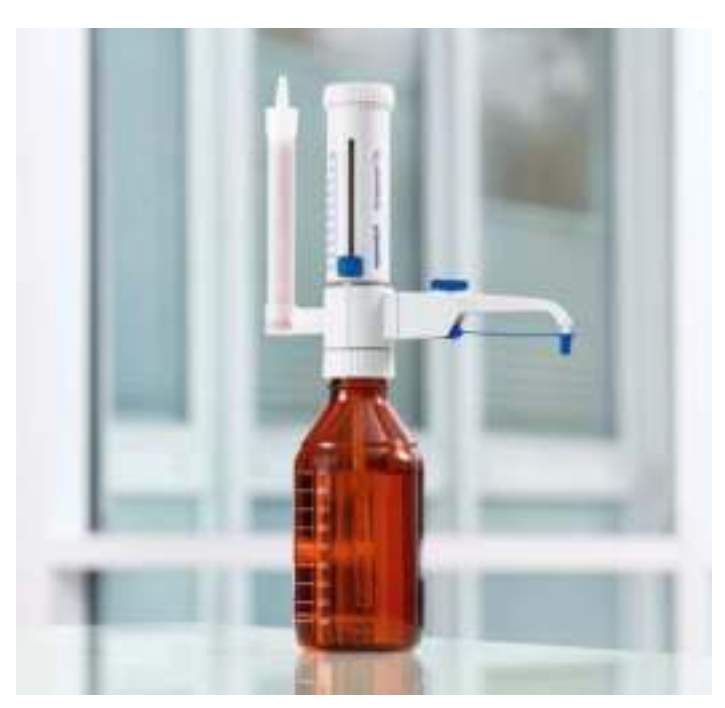
E.g. fuming acids often used in chemical industry need to be kept free from moisture. The drying tube – filled with moisture absorber protects the liquid.