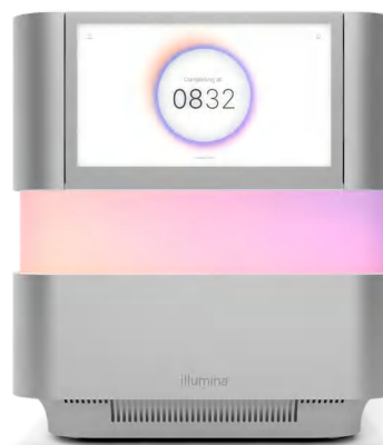
Figure 1: The NextSeq 2000 Sequencing System —The latest NGS system from Illumina offers innovative design features, advanced chemistry, simplified bioinformatics, and an intuitive workflow that enable the widest range of applications on a benchtop sequencing system.