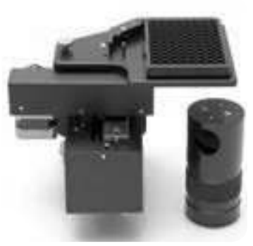
HTS/Raman High Throughput Accessory for automated FT-Raman measurements using wellplates.