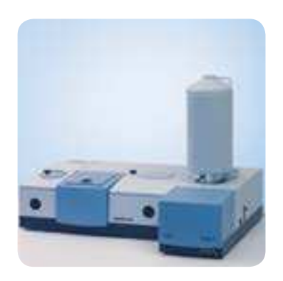
FT-Raman module RAM II connected to the VERTEX 70 FT-IR spectrometer.