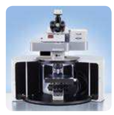
RamanScopeIII FT-Raman microscope accessory for Bruker FT-Raman spectrometers

The RAM II module is equipped with standard 1064 nm excitation for utmost suppression of fluorescence. The module can be configured with a dual channel option for additional excitation line.