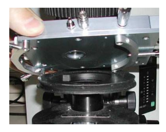
Hotstage similar to THMS350V with stage clamps being attached to circular dovetail substage.

Select the stage clamps you require from the 'Optical Accessories' section on our website.