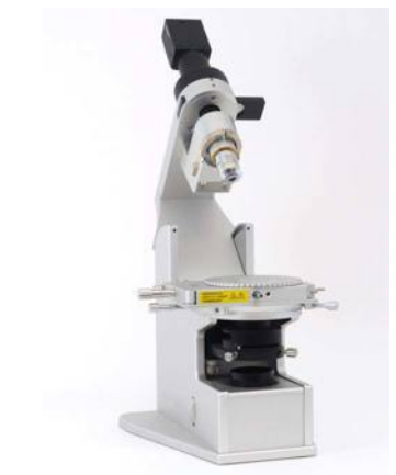
Linkam Imaging Station. Optics are tilted back to allow easy access to sample

A long working distance condenser is built into the base with polarizer and diaphragm. A 100W halogen light source and C-mount for a camera is also supplied. (See 'Imaging Station' on our website for more information).