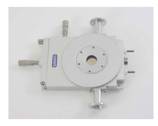
The THMS350V heating and freezing vacuum stage

Please talk to Linkam if you require this option