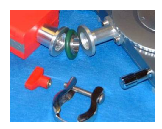
Pirani Vacuum gauge connections with THMS350V stage