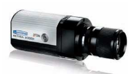
QICAM Fast 1394 non-cooled CCD Colour -Bayer Mosaic, 12-bit camera