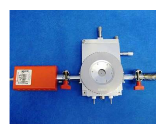
THMS350V with Vacuum Gauge attached.