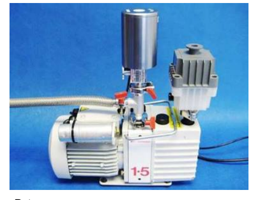
Rotary vacuum pump

A motorized valve receives pressure data via the T95-LinkPad and controls the vacuum pressure inside the sample chamber. You can dial in a specific vacuum value as part of a temperature profile and the valve will automatically control the pressure. You will need a 2.5 m³/h rotary vacuum pump for this valve to function optimally. (Including with the Pro system).