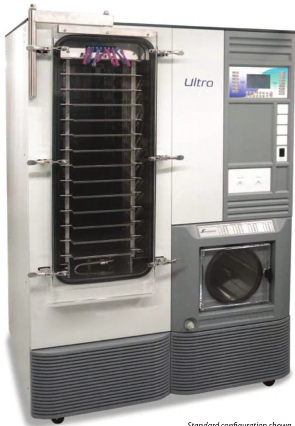
Standard configuration shown.