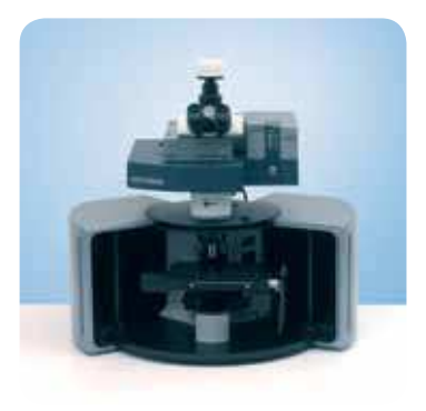
'Hybrid' Raman microscopy platform combines the best of two worlds, without the sacrifice in performance.