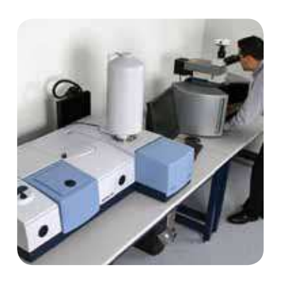
Analytical research Raman spectrometers can be configured for your demanding needs.