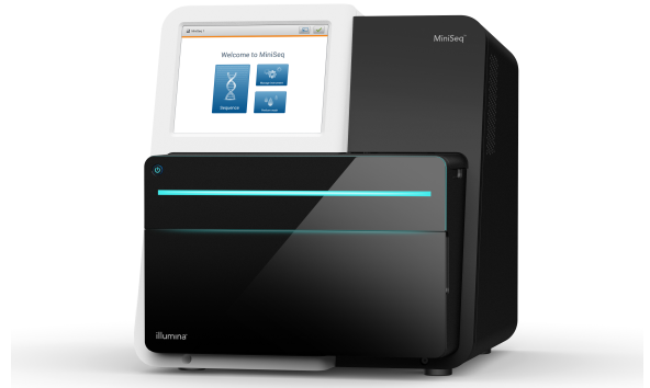
Figure 1: The MiniSeq System —By harnessing advances in SBS chemistry and simple, streamlined workflows, the MiniSeq System delivers a library-to-results solution that is powerful and easy to use.

Illumina scientists and engineers provide installation, training, and support, from assay design through data analysis