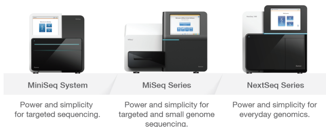
Figure 3: Illumina NGS portfolio of benchtop sequencers —Illumina NGS systems offer solutions for virtually every application, sample type, and sequencing scale. Each delivers high data quality and accuracy with flexible throughput and simple, streamlined workflows. Data can be easily compared, exchanged, and analyzed in BaseSpace Sequence Hub.