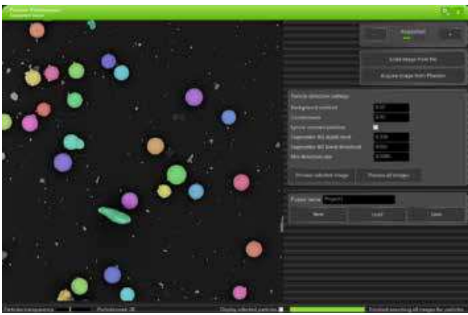
Overview processed images