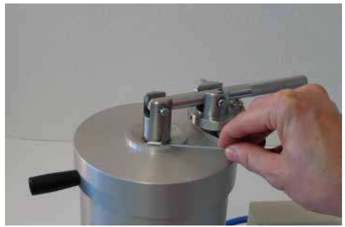
Introducing the powder in the Nebula for a proper dry dispersion