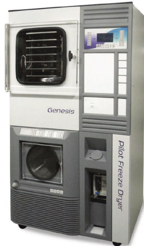
Standard configuration shown.

Note: Other electrical configurations available.