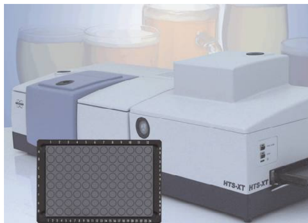
Fig 1.) Silicon microplates for IR spectroscopy; IR microplate module HTS-XT

compounds in the initial, intermediate and final products of the brewing process are defined by the respective brewing associations. All these methods are labour intensive, time consuming and require chemicals that are partly harmful or toxic. Moreover, these methods do not allow an analysis that can be performed at-line, during the brewing process.