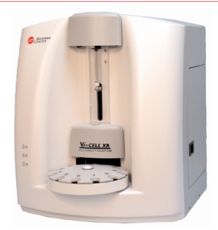
Figure 1. The Vi-CELL XR.

The objective of this work was to describe a method for cord blood sample preparation, and develop a cell type, accurate set of instrument parameters, for the Vi-CELL XR.