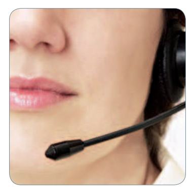
Highest quality standards and personal customer service guarantee a reliable and efficient solution.