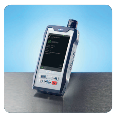
Results are clearly visible and presented self-explaining on the graphical user interface.