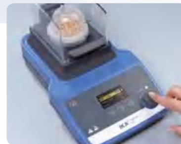
Step 3 | Start the milling process