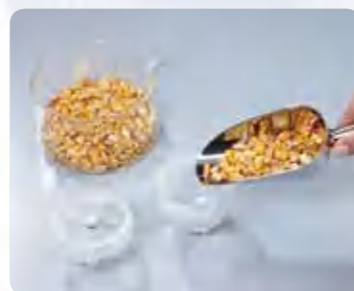
Step 1 | Fill the sample in the grinding chamber

After grinding, a part of the sample will be analyzed. The remaining sample can either be discarded or it can be stored as a reference sample directly in the grinding chamber. In the later case, grinding chambers can be labeled and either stored in a refrigerator or in a drying room. Reference samples can be re-analyzed and traced at any time.