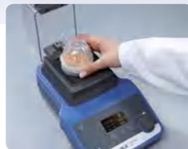
Step 2 | Attach the grinding chamber onto the Tube Mill