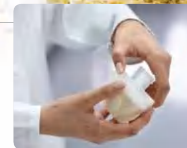
Step 6 | Remove the grinding sample