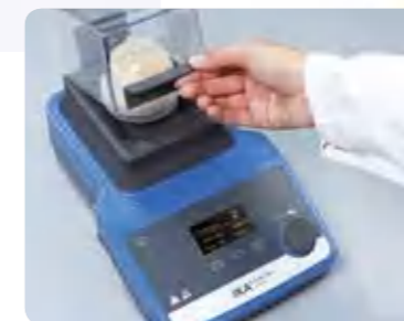
Step 5 | Remove the grinding chamber