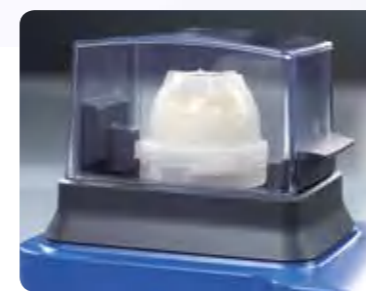
Step 4 | Grinding the sample