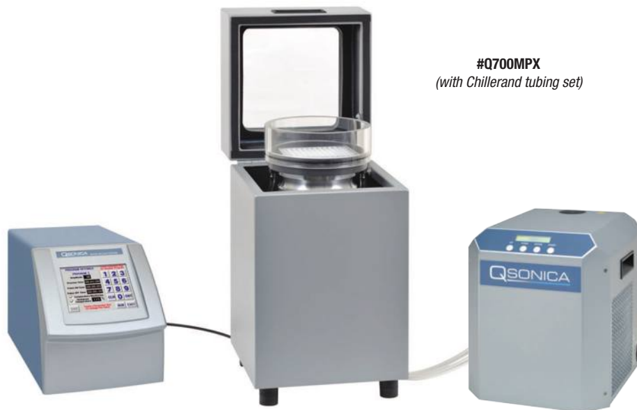
#Q700MPX (with Chiller and tubing set)

Simply place your samples within the water-filled reservoir and the sonic energy is transferred into each individual well or tube.