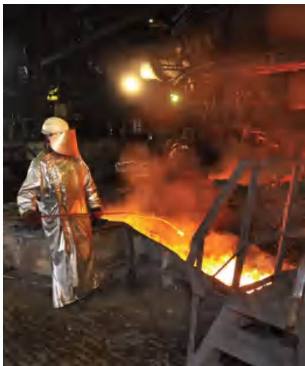
Figure 1: Sampling of slag in a steel production plant .

The slag samples were crushed and the remaining metallic iron was removed with a magnet before grinding. The slag powders were pressed to pellets by using 15 g of sample material and 1 g grinding aid (Figure 1). The key advantage of pressed pellets when compared to fused beads is the fast and simple procedure. Careful pellet preparation enables high repeatability and reliability, specifically for minor and trace element analyses.