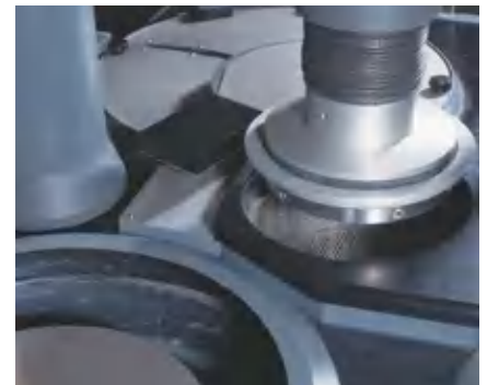
5. When the grinding is completed, the specimen holder is carried to the cleaning chamber