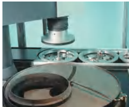
2. Specimen holders are fed into the first position - plane grinding - by conveyor