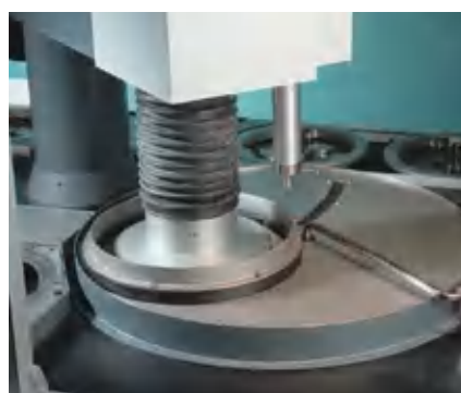
4. Grinding is now in operation. The next specimen holders are ready for collection