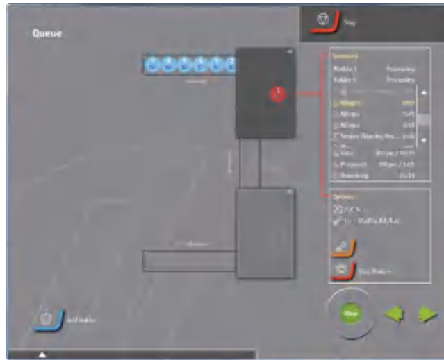
1. Six specimen holders queue up in the conveyor leading into MAPS-2

MAPS-2 takes care of the entire preparation process, even when it comes to the most complex specimens, leaving the operator time for other chores. In many cases, materialographic preparation has been a bottleneck. MAPS-2 eliminates this problem and leaves plenty of time for the one task which has not yet been satisfactorily automated: microscopic examination and evaluation of a materialographic structure.