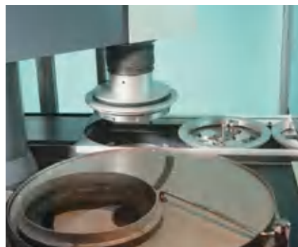
3. The specimen holders are collected from the conveyor, using a special lifting device