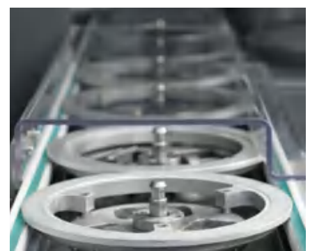
7. The finished specimen holder is moved to the conveyor, where it can be collected by the metallographer for microscopic examination