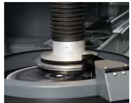
6. After fine grinding the specimen holder moves on to polishing