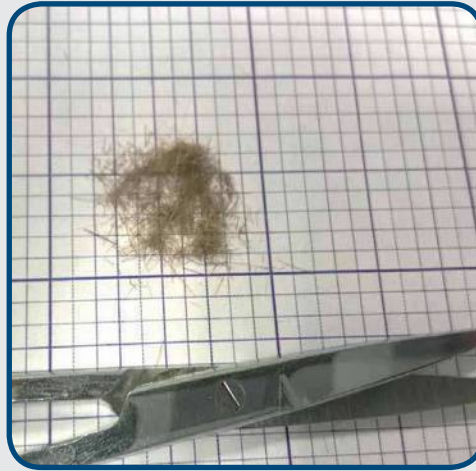
Standard Method (Chopped Hair)

More effective results for downstream applications