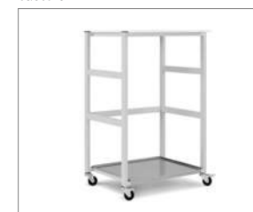
Stack on stacking frame with casters