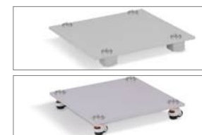
Roller base and Stacking adapter with two C 170