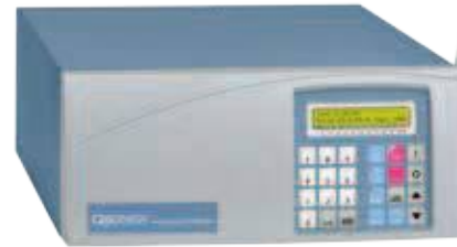
Stand sold separately.

The Q2000 Sonicator allows the user to program processing times and a full range of intensity settings. Processing time can be set from 1 second to 10 hours. A pulsing feature is also included. Pulsing can reduce the amount of heat generated by sonication when processing temperature sensitive samples. A temperature monitoring probe option is also available.