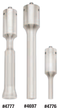
#4777 #4697 #4776

The #4777 comes standard with the Q2000 System. The two additional probes are available as options to accommodate other sample volumes.