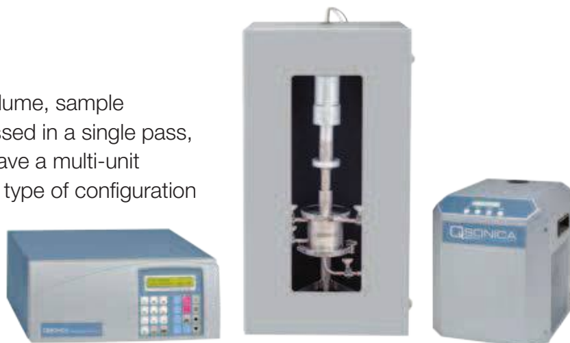
Sound enclosure and chiller sold separately.

The processed liquid exits the unit through an outlet port. The degree of processing can be controlled by adjusting the intensity of sonication as well as flow rate.