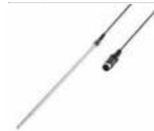
PT 100.70 temperature sensor Immersion depth: 230 mm; Diameter: 3 mm; Material: AISI 316 Ti Ident-No.: 0020000440