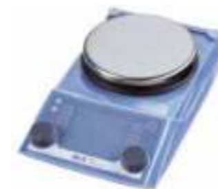
H 104 Protective hood for RET control Ident-No.: 0004209500