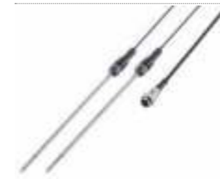
PT 1000.51 temperature sensor Two separate stainless steel sensors. Glass-coated for working with aggressive mediums such as acids and alkalis. Suitable for the RET control-visc and RET control-visc white magnetic stirrer Ident-No.: 0003377700