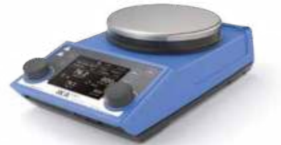
RET® control-visc Ident-No.: 0005020000

H 104 protective cover, IKAFLON 30 and 40 magnetic bars, PT 100.70 temperature sensor, USB cable