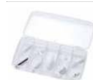
RS 2 set of magnetic stirring bars Consisting of IKAFLON® and TRIKA® stirring bars Ident-No.: 0004499100