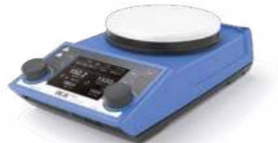
RET® control-visc white Ident-No.: 0005030000