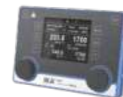
WiCo RET control-visc Wireless remote control for controlling and documenting all RET control-visc parameters. Ident-No.: 0020007259