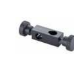
H 44 Boss head clamp Ident-No.: 0002437700