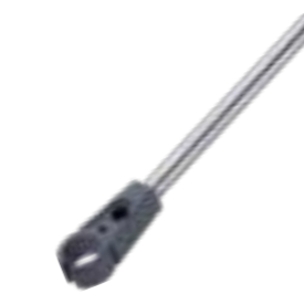
H 38 Holding rod Ident-No.: 0003547700