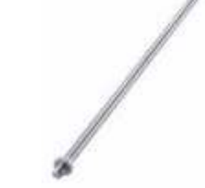
H 16 V Support rod Ident-No.: 0001545100